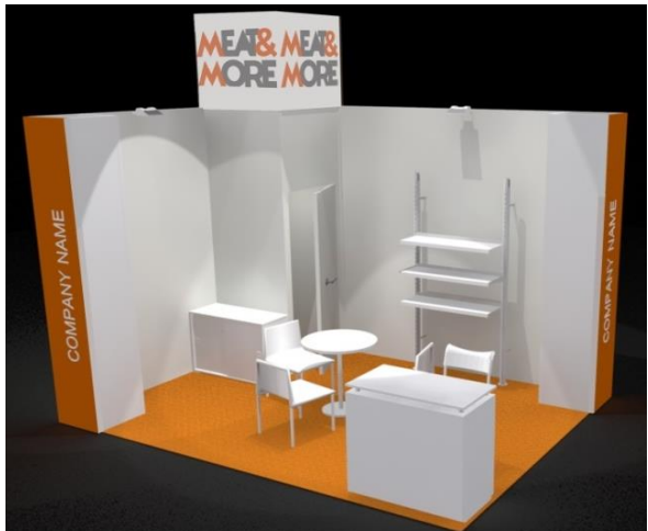
Fully furnished stand 12 sqm